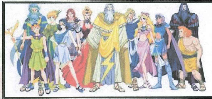
The twelve Olympians

Aphrodite, Hephaestus, Hermes and Dionysus.