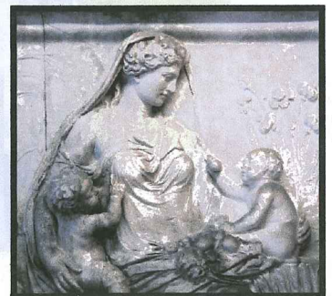
Gaea (Mother Earth)

That most of the gods, goddesses and Titans married their brothers or sisters.