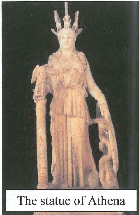
The statue of Athena

Athena is the goddess of art, wisdom and war. She taught people how to do arts and crafts. The Parthenon was built to honor her, inside there was a forty-foot tall gold and ivory statue of her. She was born from Zeus's head dressed in full armor for battle. The city of Athens is